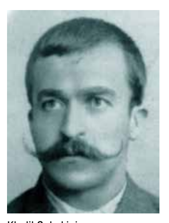
Khalil Sakakini as a young man.

Participants discussed Palestinian experiences with alternative education and free thought in schools, universities, political parties, labour unions and even prisons. They debated what a new definition of emancipatory education based on the Palestinian experience would be. Participants contributed ideas that were "outside the box" and proposed future initiatives and projects that could be used to localise and disseminate the concept of emancipatory education.