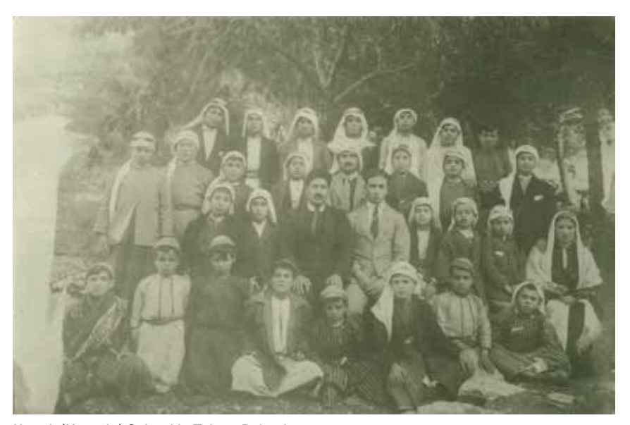
Kuttab (Koranic) School in Tubas, Palestine, 1904

No doubt, we must address the education in the schools, but how? Teachers' pay ranges between NIS 2,000 to 3,000 (about $400 to $600) per month; many of them are compelled to do another job in the afternoon to pay their bills. The problems with the system have a major economic component.